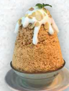
Thai Tea Kakigōri

hojicha ice kuromitsu jelly whipped cream kinoko powder almond dice kuromitsu syrup