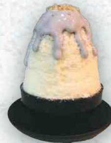
Mont Fuji Kakigōri

melon milk ice fresh honeydew nata de coco almond flakes