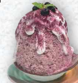
Mont Mauve Kakigōri

watermelon ice lychee nata de coco chocolate chips