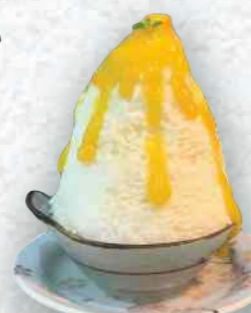
Mango Yogurt Kakigōri

milk ice fresh mango cheesecake cracker crumbs whipping cream mango purée