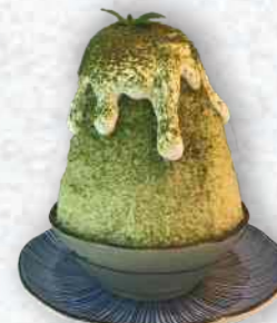
Matcha Latte Kakigōri

mix berry ice fresh strawberry blueberry raspberry whipped cream kuriaro rose powder