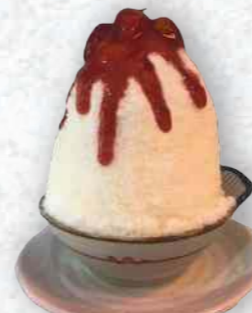
Strawberry Cheesecake Kakigōri