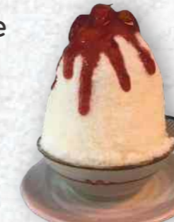
Strawberry Yogurt Kakigōri

milk ice fresh strawberry cheesecake cracker crumbs whipping cream strawberry purée