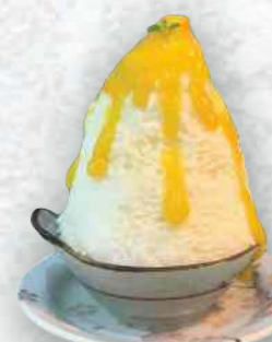
Mango Cheesecake Kakigōri

milk ice kuromitsu jelly garrett popcorn caramel toffee sauce