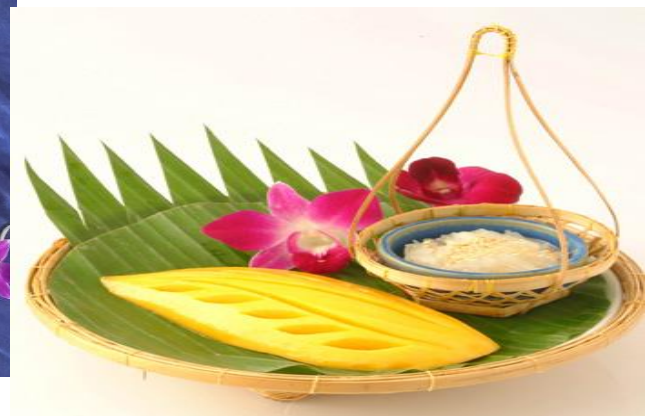
Fresh Thai Mango & coconut rice DKK. 105.00