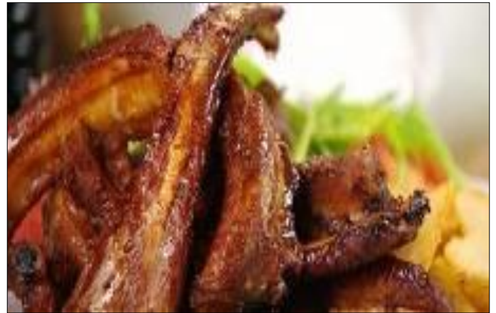
Spare Ribs A large plate of caramelized spare ribs, grilled in the special "Blue Elephant" way, DKK. 170,00 including one drink