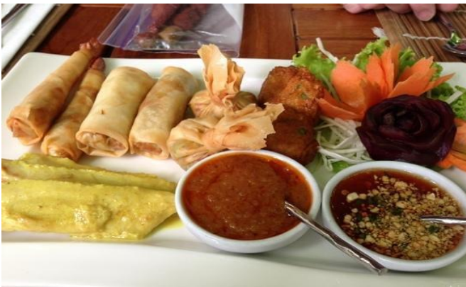
Tapas A selection of classic favorites starter, DKK. 155,00