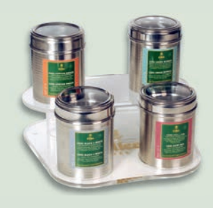
Semicircular acrylic display with 4 slots for silver metal tins