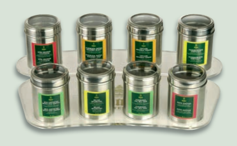
Semicircular acrylic display with 8 slots for silver metal tins