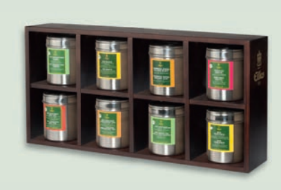
EILLES TEE - Wooden shelf for 8 tins in wenge