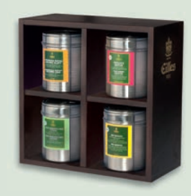
EILLES TEE - Wooden shelf for 4 tins in wenge

Article no. 6626 in beech Article no. 66261 in wenge