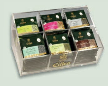
Slanting acrylic box with 6 slots for Tea Diamond® sachets Article no. 6451

Article no. 6624 in beech Article no. 66241 in wenge