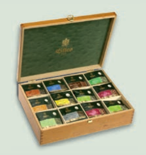
Wooden box with 12 slots for Tea Diamond® sachets

Article no. 6626 in beech Article no. 66261 in wenge