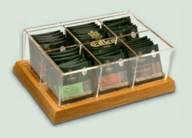
Acrylic box with lid and 6 slots for Tea Diamond® sachets

Article no. 6624 in beech Article no. 66241 in wenge