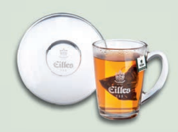
EILLES TEE - Glass saucer Article no. 6650