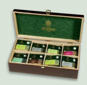
Wooden box with 8 slots for Diamond® sachets – in wenge