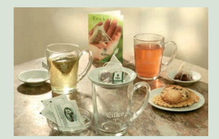
Fig.: Tea Diamond® table setting

Fashionable EILLES TEE glass with logo -300 ml