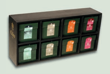
EILLES TEE - Wooden shelf for 8 fliptop boxes Article no. 6582