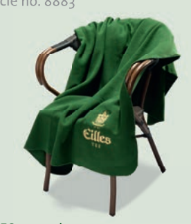
EILLES TEE - Fleece rug 150 x 120cm Article no. 6690

EILLES TEE - Tins with hinges lid, empty Article no. 8883