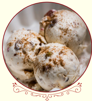
Christmas Ice Cream

Our homemade raisin, sultana, citrus peel, candy peel, ginger preserve and fresh milk in a wonderfully creamy ice cream. Now this is superbly Santa inspired.