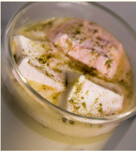
Matcha Green Tea inspired Hot White Chocolate with Tea Marshmallows

Thick and richly delicious white chocolate blended and sprinkled with our Ceylon Matcha Green Tea and topped with our Rose & French Vanilla 'tea-mallows'. The melted marshmallows are a fabulous filter for the sensational matcha blended white chocolate. Rs.450