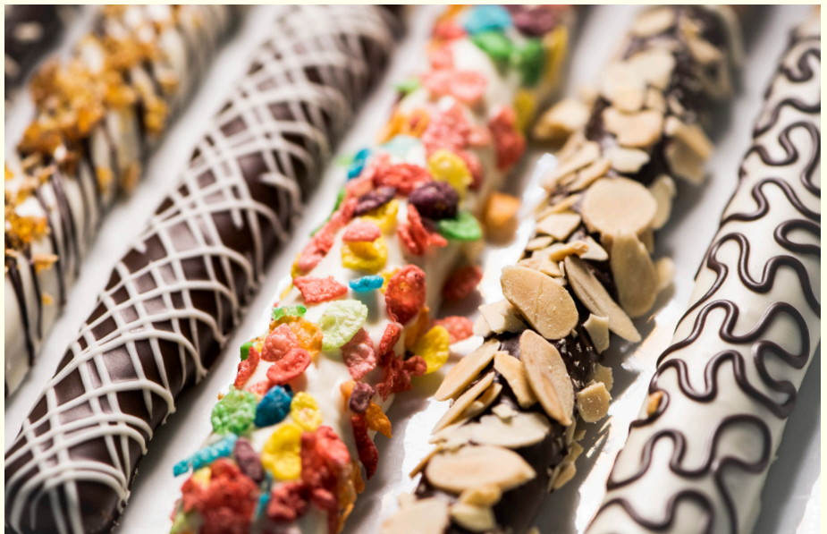
Chocolate Covered Cinnamon Shortbread Cigars

Lightly Cinnamon spiced shortbread cigars enrobed in milk or white chocolate, some studded with crisped rice, others with almond or nougat. The perfect accompaniment for your Christmas Tea. 2 pcs Rs.250