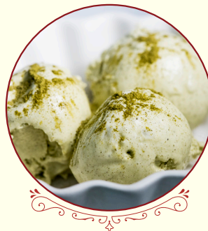
Matcha, Lychee & White Chocolate Ice Cream

A richly delicious dark chocolate blended with our Earl Grey Tea. Wonderfully creamy with a beautiful finish.