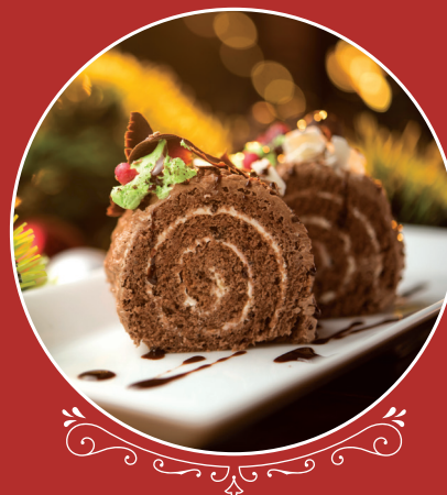
Xmas Chocolate Yule Log