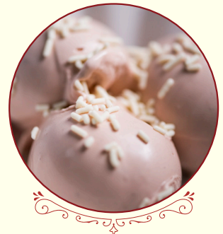
Rose with French Vanilla White Chocolate Ice Cream

A profusion of flavour with high grown Ceylon Matcha Green Tea beautifully complemented by Lychees and white chocolate.