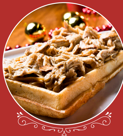
Waffles & Crêpes