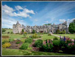
Nethybridge Hotel Inverness-shire