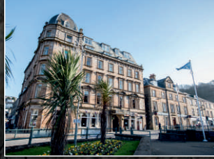
The Royal Hotel Oban