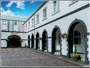
Ben Nevis Hotel & Leisure Club Fort William