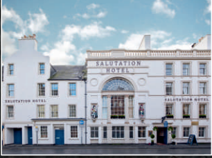
Salutation Hotel Perth