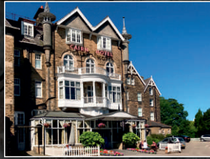
The Cairn Hotel Harrogate

The Alexandra Hotel is part of the Strathmore Hotels Group offering you a range of friendly, quality properties in the North of England and Scotland to suit your hotel requirements.