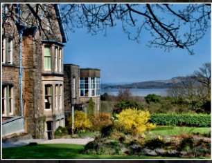
Cumbria Grand Hotel Grange over Sands