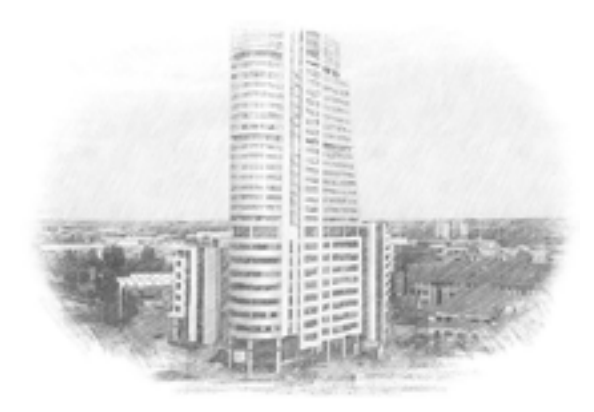
Flavour Map Number: 19

The highest building in Yorkshire, Bridgewater place is a modern icon. We wanted to celebrate some of Yorkshire's best, using two local gins, the flavour of rhubarb and the best tea in the world! Sit back and enjoy this refreshing sharing cocktail.