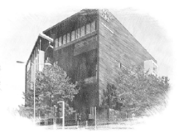
Flavour Map Number: 13

Northern Ballet is a dance company based in Leeds with a classy and sophisticated reputation – this cocktail is exactly that. Bringing together a local rhubarb gin and champagne, you wouldn't feel out of place at the ballet with this.