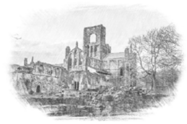
Flavour Map Number: 1

The highly distinctive Benedictine, first created by Monks in 1510 (while Kirkstall Abbey was still functioning) serves as this drink's centre-piece.