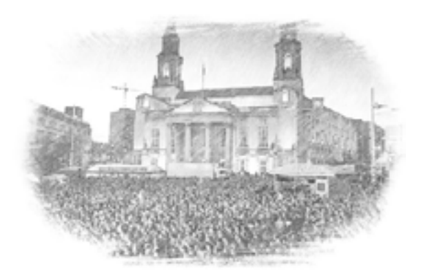
Flavour Map Number: 10

Belvedere Strawberry Lemon Mini Moët & Chandon Bottle Sparkles