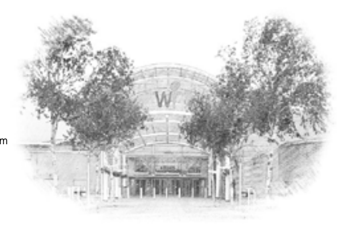
Flavour Map Number: 18

Tanqueray Flor de Sevilla Triple Sec Yorkshire Tea Syrup Apple Lemon Rose and Elderflower Foam Contains Egg White