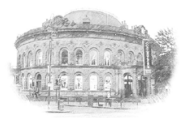
Flavour Map Number: 2

Bourbon is distilled from corn and so to represent Leeds Corn Exchange we've come up with a popcorn-twist on the classic bourbon Old Fashioned served with popcorn on the side.