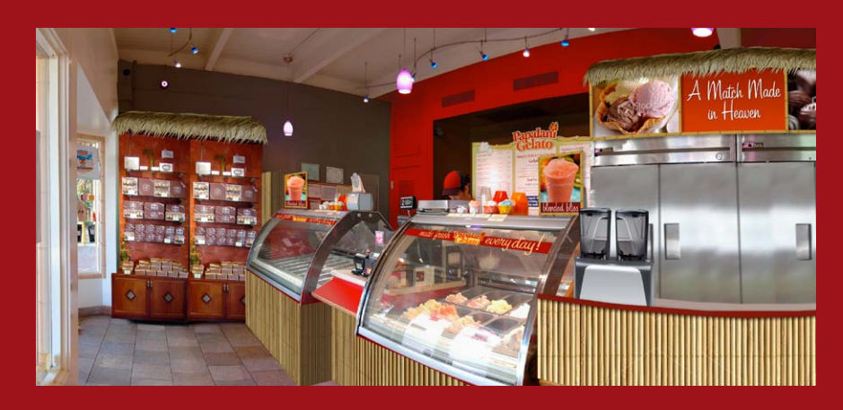
Consistent trade-dress in all Papalani Gelato® locations helps to reinforce the tropical feel of Hawaii.

Your Full Store has the capacity to make products for multiple locations—allowing you to leverage your investment by adding additional locations with much smaller capital investment and ongoing expenses!