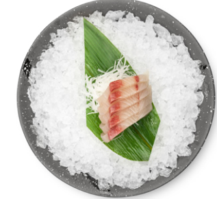
Kingfish sashimi / GF / 9