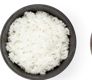
White rice GF/VG/3