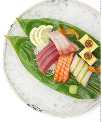
Sashimi deluxe GFO / 24.5

Assortment of salmon, tuna, kingfish, scallop and tamagoyaki sashimi