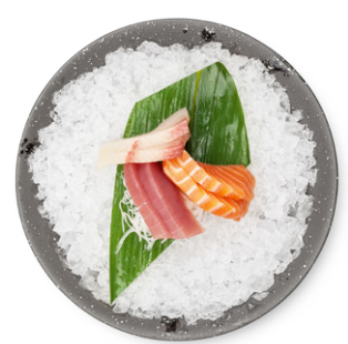
Mixed sashimi GF / 13.5 Assortment of salmon, tuna and kingfish sashimi