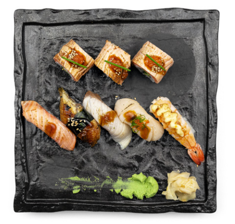
Gluten free nigiri set (9pcs.)

Nigiri set (9pcs.) / 16.5 Salmon, Prawn, Kingfish nigiri and Shrimp roll with avocado