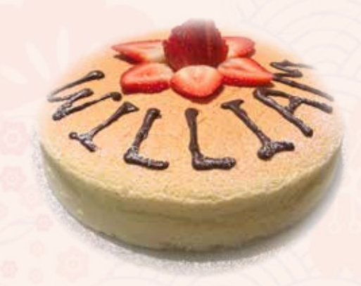
Japanese Fluffy Cheese Cake 8 inches 45.00 9 inches 55.00 10 inches 65.00