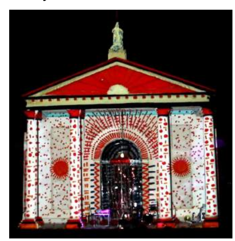
Visual Architecture—a recent example.

On Fri 10 Sept, from 7pm onwards a colourful light show on the Kyneton Mechanics Institute façade will highlight the building in a spectacular way, similar to the White Night displays in Melbourne and Bendigo. The brilliant display of colours will feature the work of Kyneton Primary students and be created and projected by video artist and film maker Jim Coad.