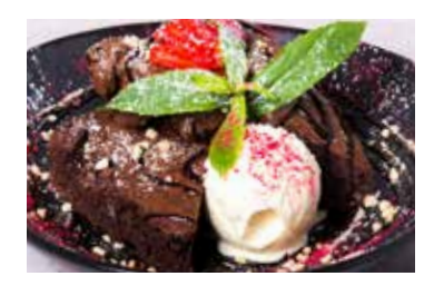
BROWNIE WITH NUTELLA® 9 Topped with salted nut crumble, vanilla ice cream & warm Nutella®