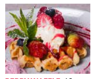
BERRY WAFFLE 12 Belgian waffle,fresh berries, strawberry sauce, fairy floss & vanilla ice cream