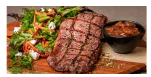
180G STEAK 23

Sautéed chicken breast, caramelised onions, herbs & RASHAYS® creamy mushroom sauce