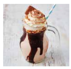
TIM TAM® RASHAKE 10