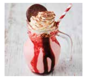
WAGON WHEEL® RASHAKE 10

Minty vanilla ice cream shake with whipped cream & a Nestlé Mint Pattie®