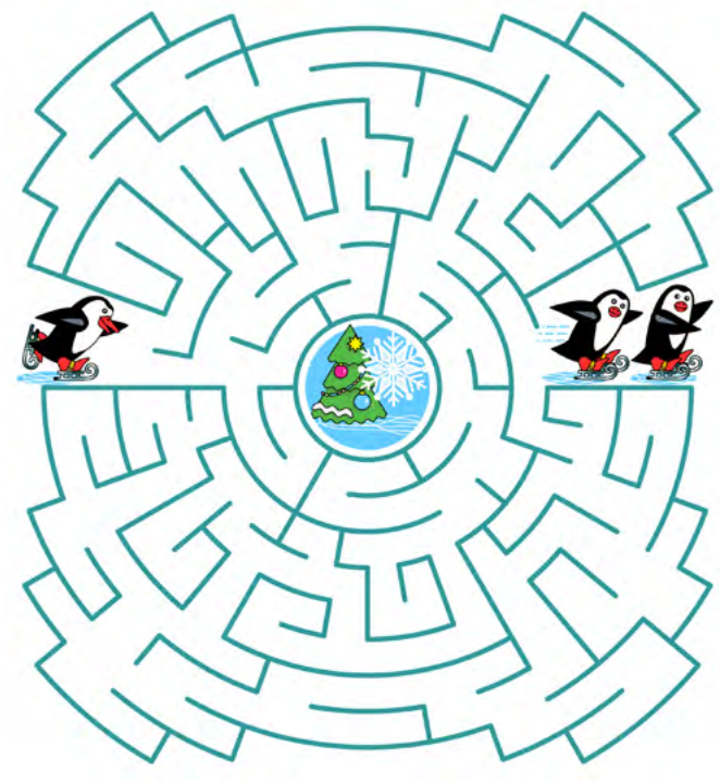
Help the penguin join his friends.