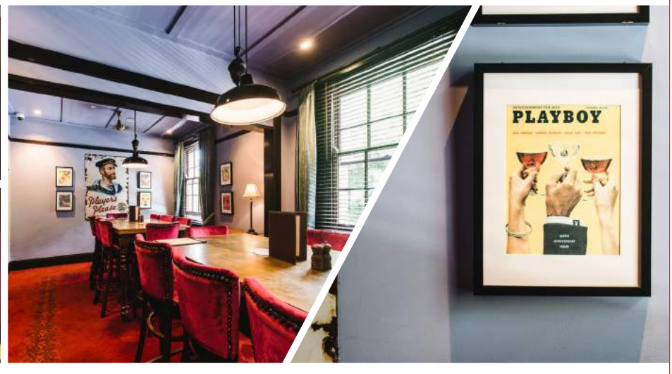
Up to 14 people seated / 30 cocktail style

The perfect space for a small cocktail style event or a private dining experience.