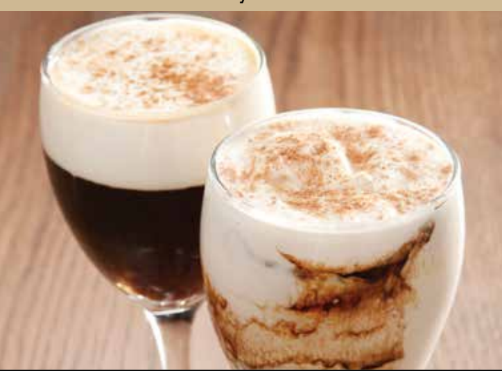
Not for Sale to Persons Under the Age of 18. Drink Responsibly.