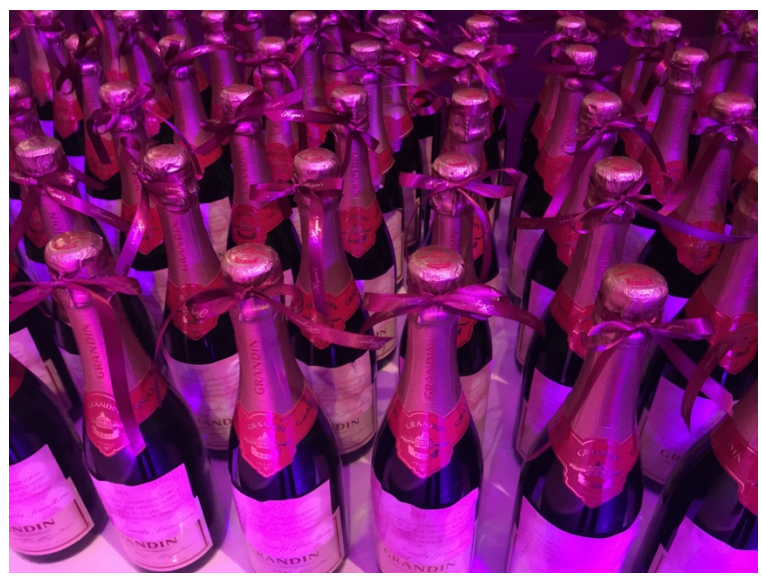
Questions associated with the drinks:

Children's meals consist of a main course, and a chocolate or strawberry sundae. The main course is usually decided prior to the event. Most people choose something like chicken or fish goujons, and chips, but we can also provide risotto, or steak. Children's meals are designed for children up to 10 years old, and portioned accordingly. They cost $25.00.